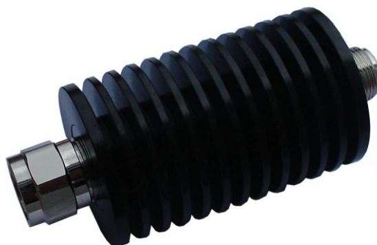
Figure 1 JX-RN-25-XX-3 Attenuators front panel layout